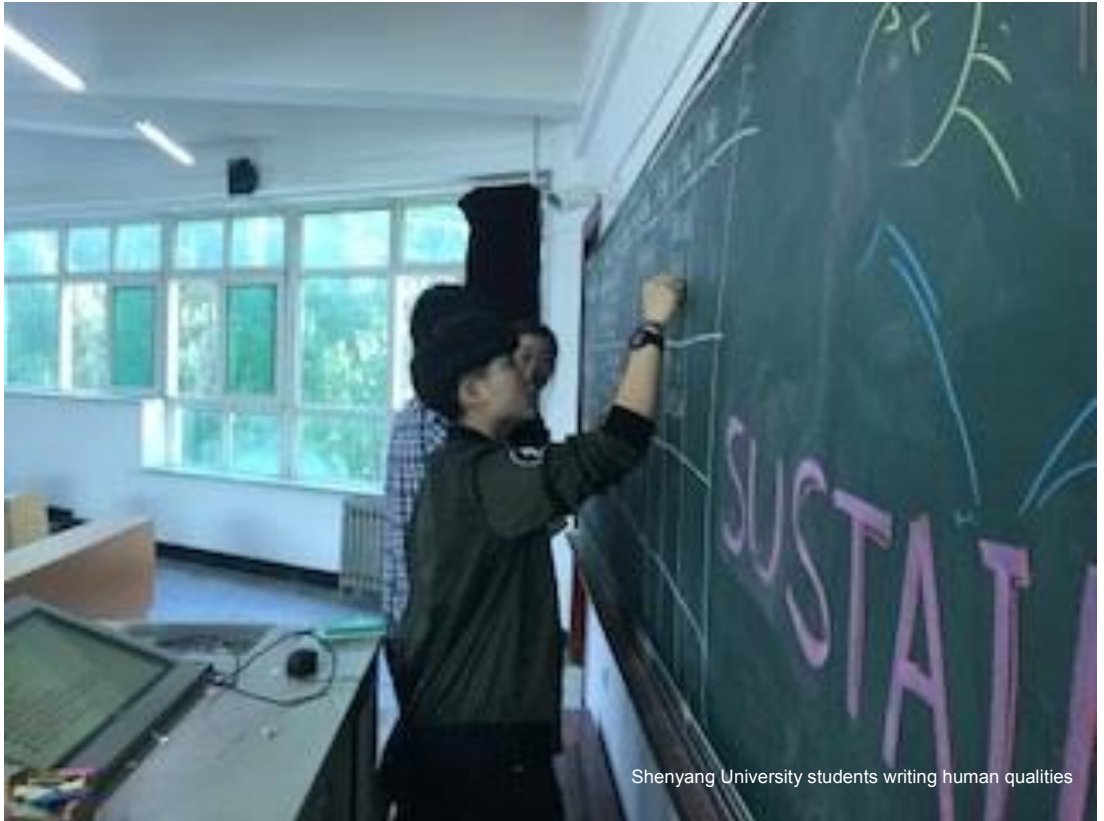
Shenyang University students writing human qualities