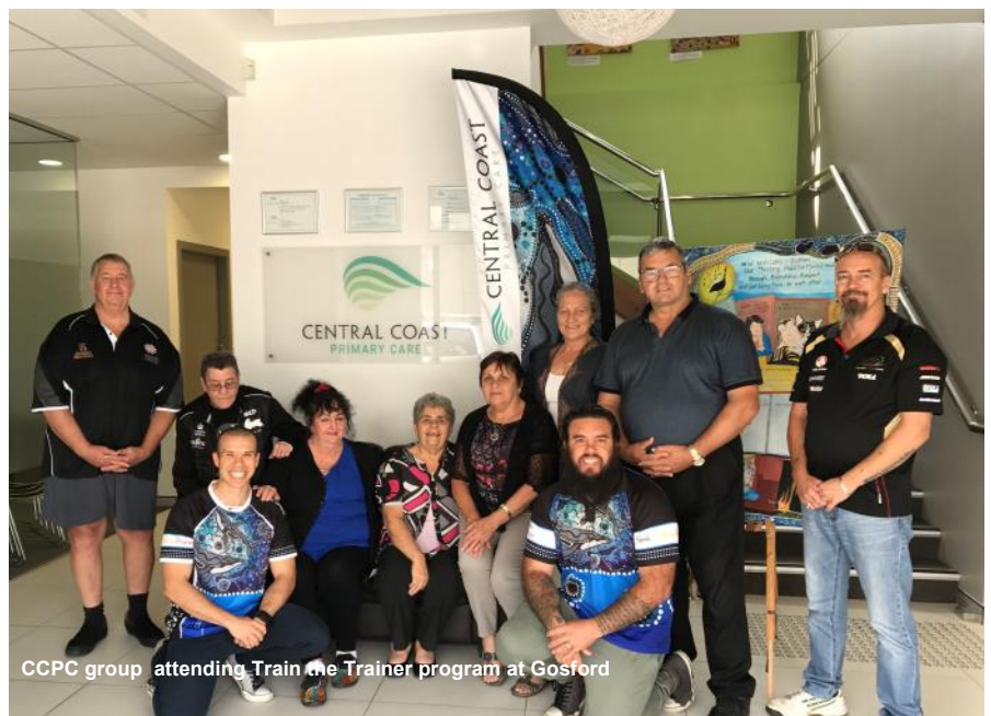
CCPC group attending Train the Trainer program at Gosford