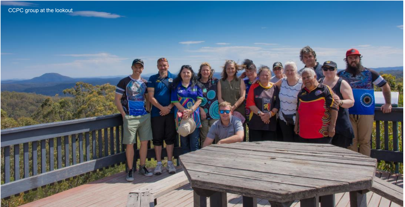
CCPC group at the lookout