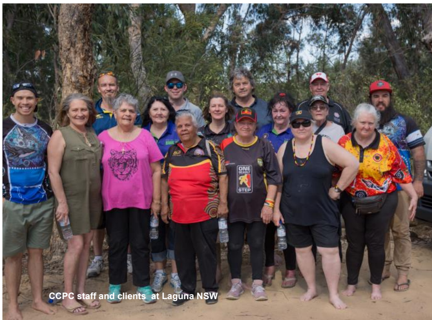
CCPC staff and clients at Laguna NSW