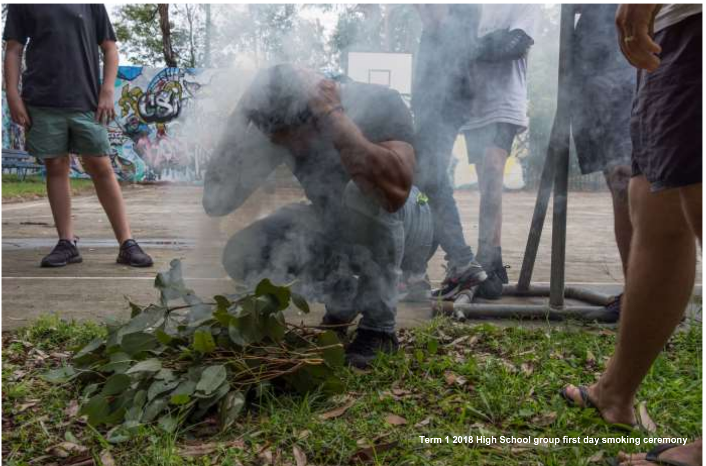
Term 1 2018 High School group first day smoking ceremony