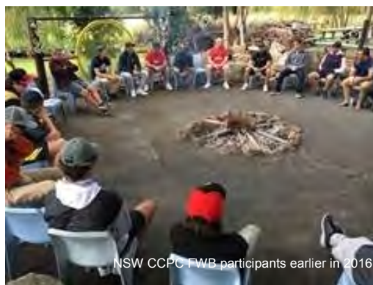
NSW CCPC FWB participants earlier in 2016