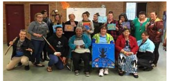
FWB Female Program RYSS Wyoming Youth Centre Elders Art Day, and visit to The Rig 24/7 Gym The Entrance