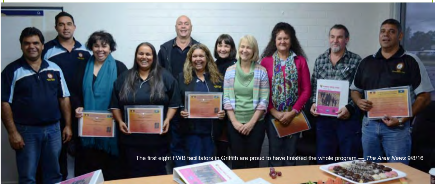
The first eight FWB facilitators in Griffith are proud to have finished the whole program — The Area News 9/8/16

Four of the eight facilitators have spread the FWB love to Narrandera and Lake Cargelligo by providing FWB groups to the local community and workers, resulting in another 7 local workers completing the 5 stages. Since then, FWB groups have been delivered to girls who are disengaged from school, men returning to the community from prison and clients at Tirkandi Inaburra (a residential youth centre aiming to build cultural identity and empower young boys). The program has been received positively by the participants in these groups. They report to feel more confident and they love the way FWB makes them look at situations differently. The facilitators are looking forward to delivering more groups to the community soon.