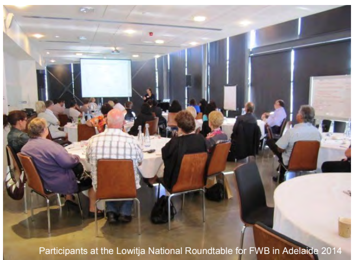
Participants at the Lowitja National Roundtable for FWB in Adelaide 2014