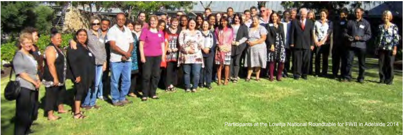
Participants at the Lowitja National Roundtable for FWB in Adelaide 2014

In March 2014, The Lowitja Institute convened a national roundtable in Adelaide to consider the impact of FWB and opportunities for future development. Approximately 50 participants attended the Roundtable from across community, training and delivery, research and policy sectors, and shared their experiences of FWB and focused on finding strategies to support the delivery, research and uptake of the FWB program.