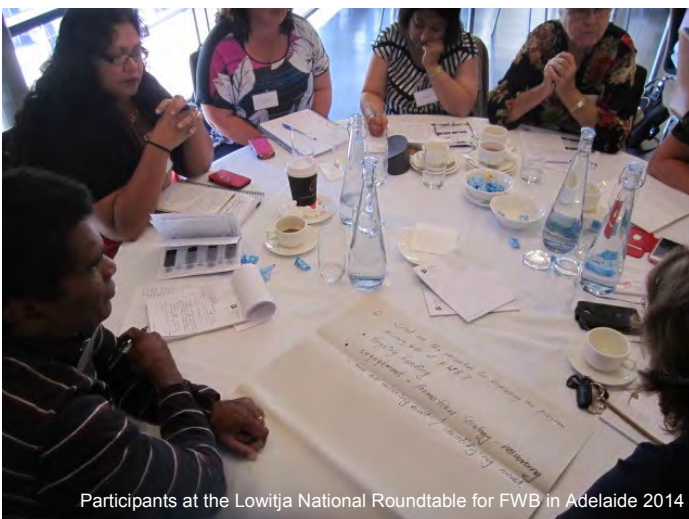
Participants at the Lowitja National Roundtable for FWB in Adelaide 2014